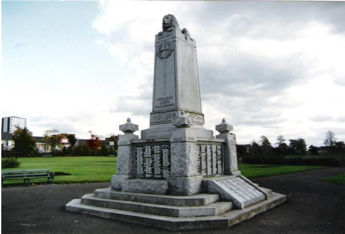
Motherwell War Memorial