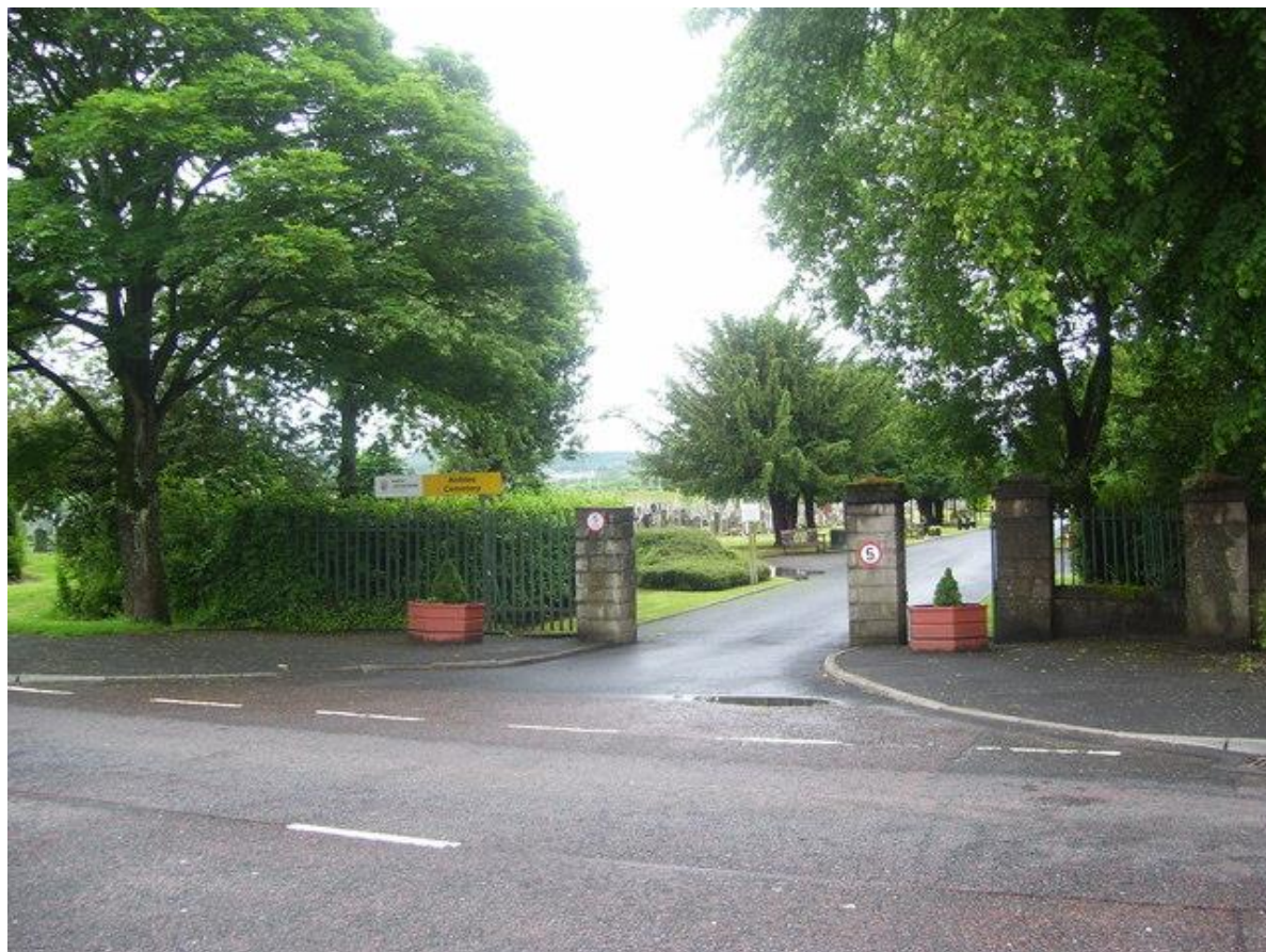
Entrance to Airbles Cemetery, Dalziel

Airbles Cemetery, Dalziel contains 79 Commonwealth War Graves – 25 relating to World War 1 & 54 relating to World War 2.